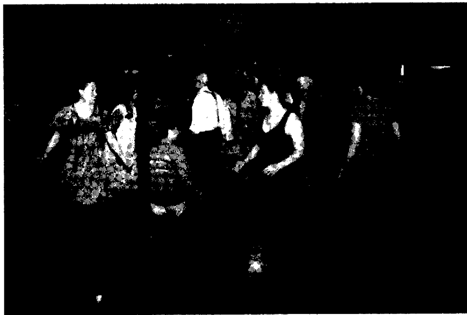
Below: Dancers and Motley Crew